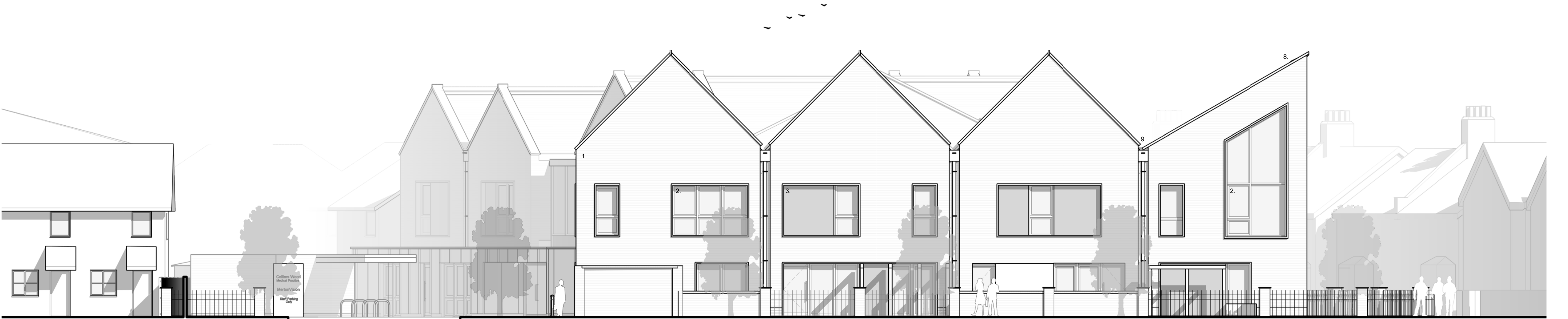
Western Elevation 1:100