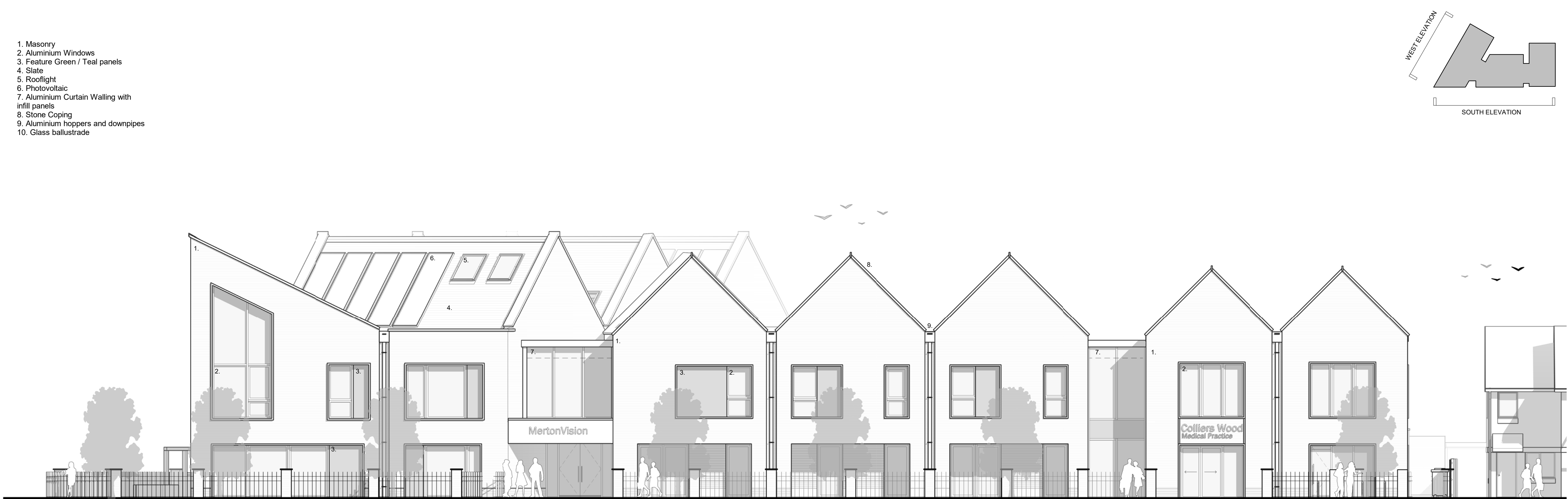
Southern Elevation 1:100